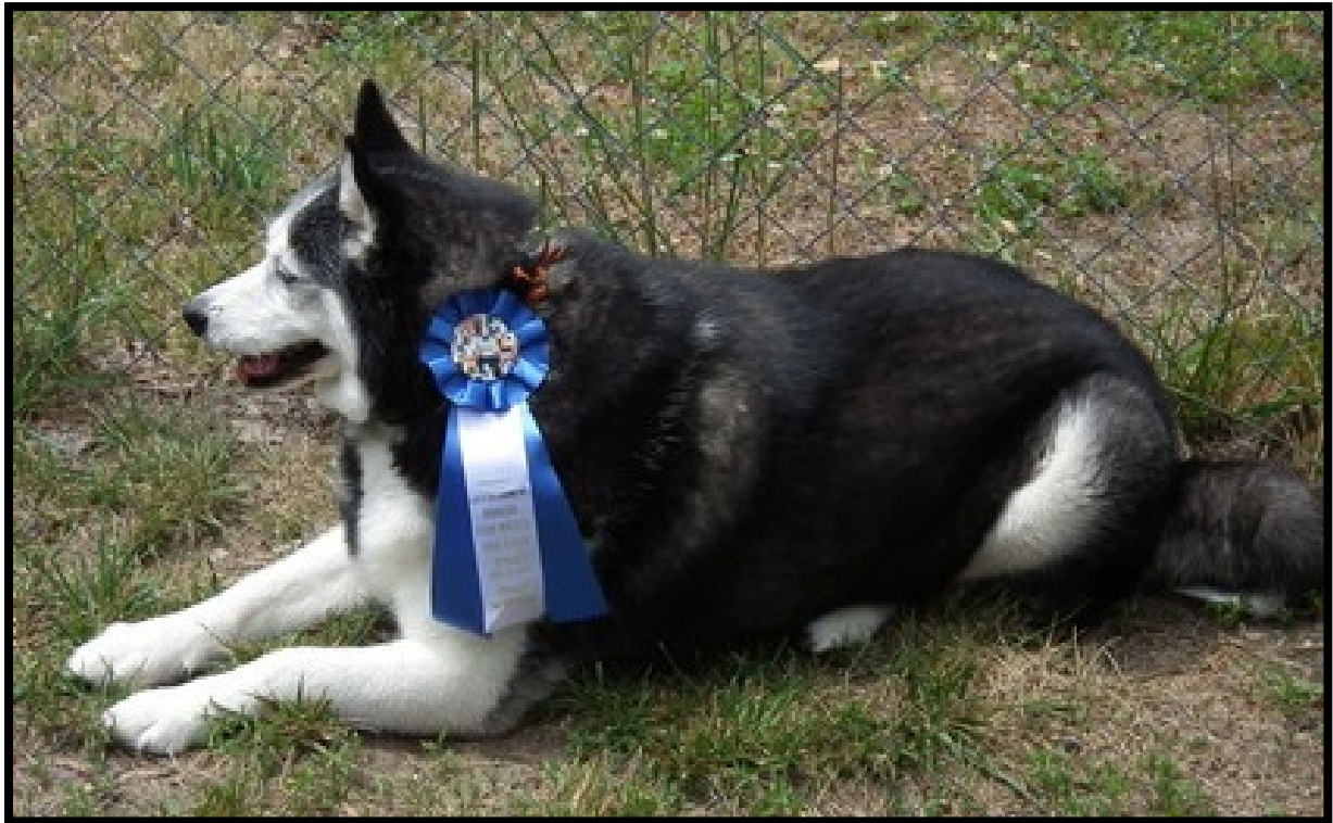
Sierra ~ MaPaw Alum and Beauty Queen!

The employees of Harrah's, Showboat, Bally's and Caesars Casinos held an employee only Dog show to raise money for the Atlantic County Humane Society.