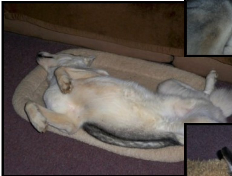
Juno gets comfy