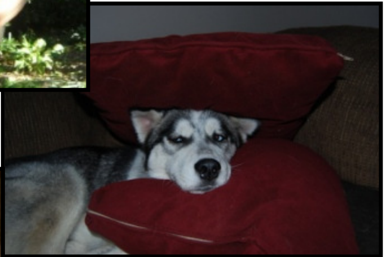
Ranger sandwich anyone?